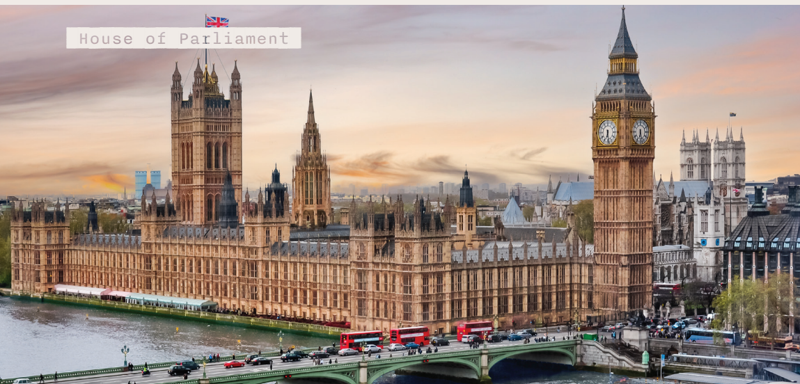
House of Parliament