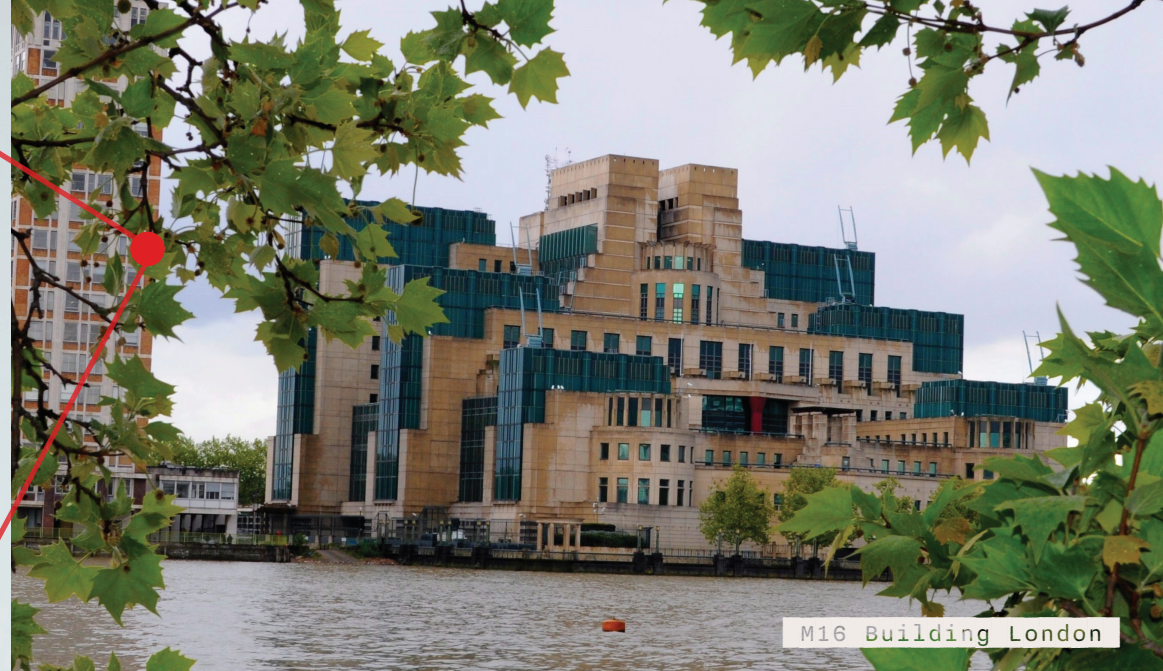
M16 Building London