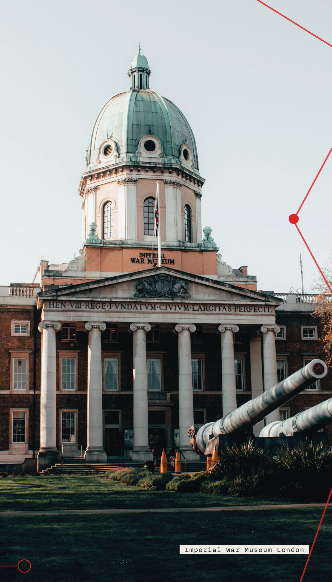
Imperial War Museum London