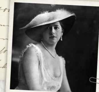
Letter written by Mata Hari, France, 1908

à l'opéra dans Le Roi de Lahore Je vous prie de me faire un grand plaisir et de me donner une place pour l'opéra, pour ce soir. Je vous recom- pense très sincère- ment M lle