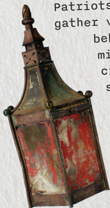
James Lafayette Lantern, 1824

behind enemy lines. His work as a spy provided critical military intelligence leading to an entrapment which crippled the British military [REDACTED] and helped secure American victory at the Battle of Yorktown. When he won his freedom after the war, James took the name Lafayette to honor his friend and comrade.