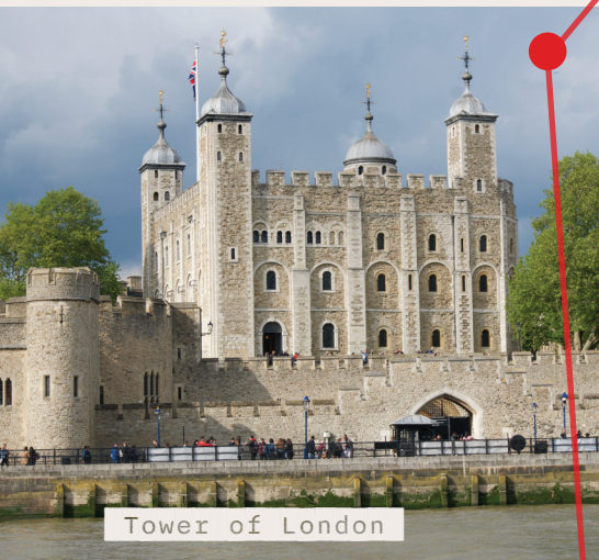
Tower of London